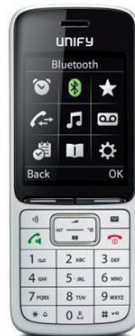
OpenScape DECT Phone SL5