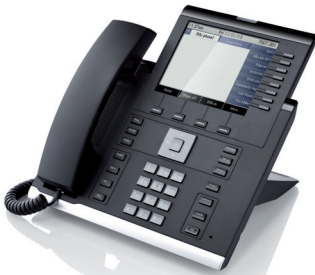
OpenScape Desk Phone IP 55G

OpenScape 4000 V8 initially supports the CP phone family in their SIP version.