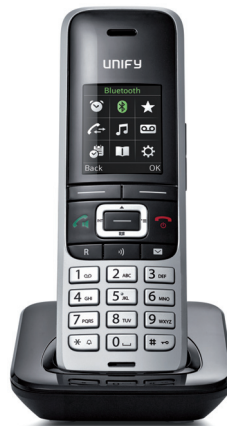
OpenScape DECT Phone S5