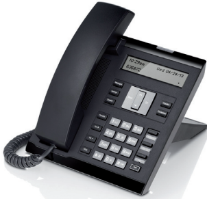
OpenScape Desk Phone IP 35G

Also with the new terminals, the customer can use the familiar scope of functionality!